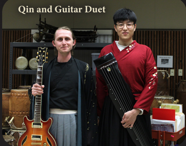
Qin and Guitar Duet